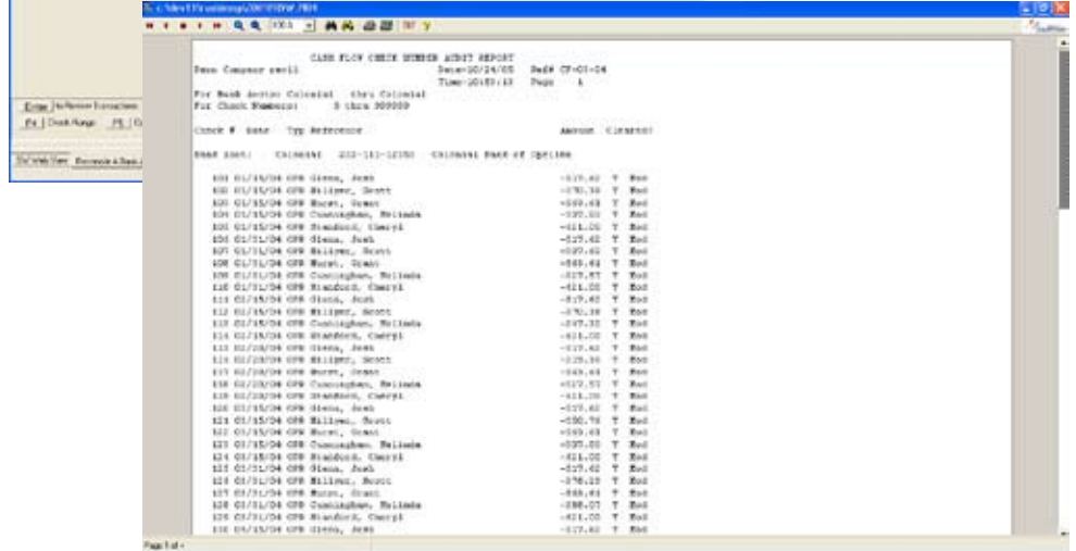
Check Number Audit Report